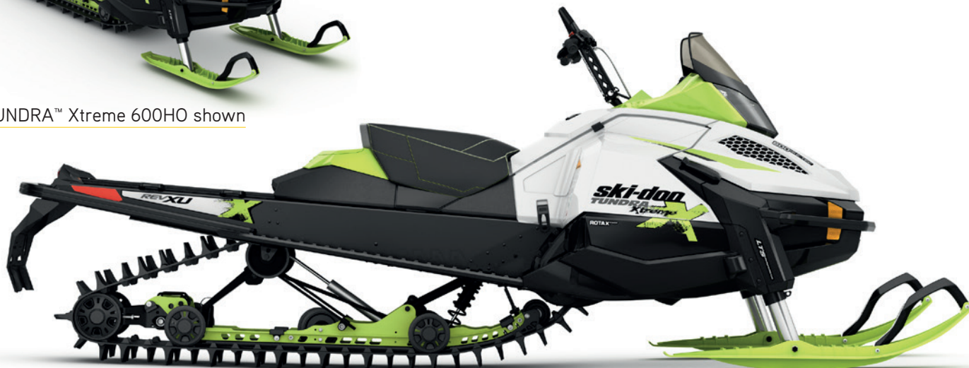
TUNDRA™ Xtreme 600HO shown