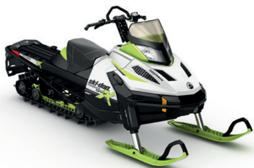
TUNDRA™ Xtreme 600HO shown