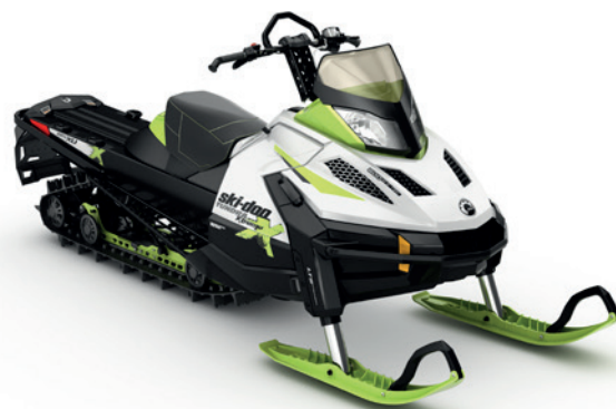
TUNDRA™ Xtreme 600HO shown