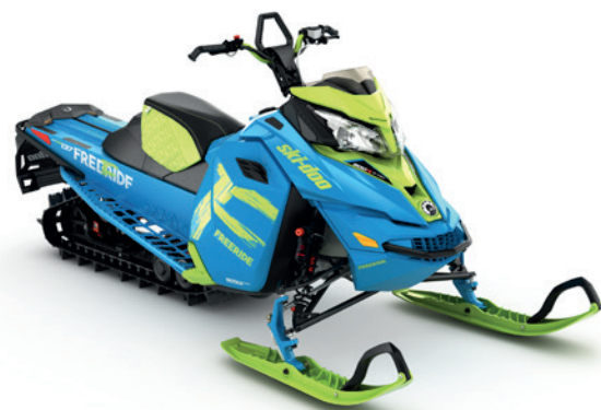
FREERIDE™ 137 shown