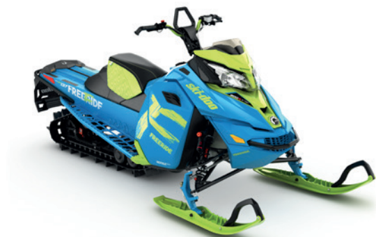
FREERIDE™ 137 shown