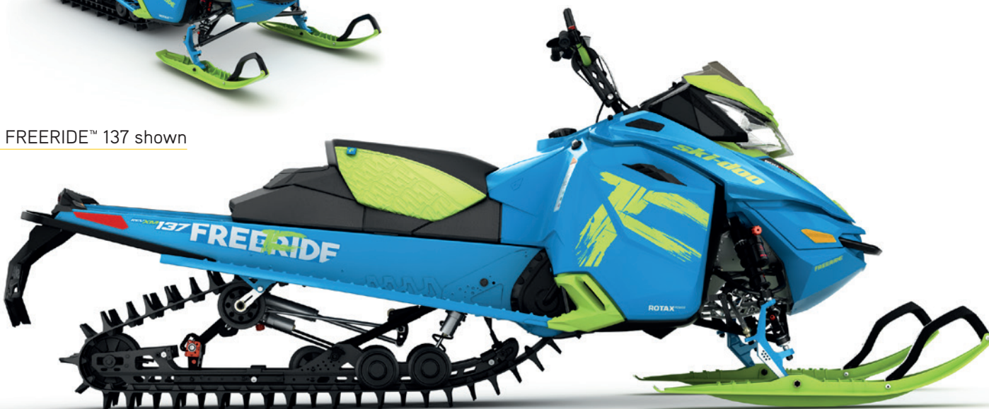
FREERIDE™ 137 shown