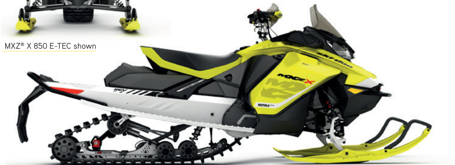
MXZ® X 850 E-TEC shown