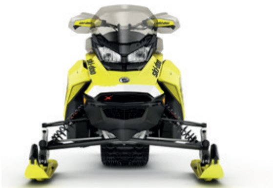
MXZ® X 850 E-TEC shown