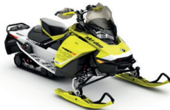
MXZ ® X 850 E-TEC shown