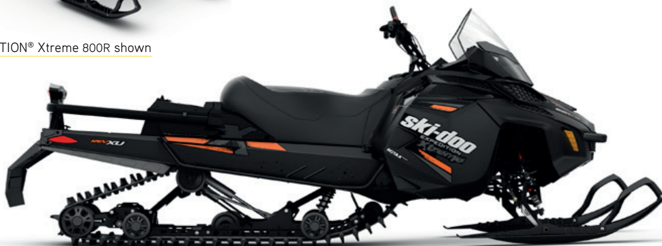
EXPEDITION® Xtreme 800R shown