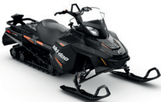
EXPEDITION® Xtreme 800R shown