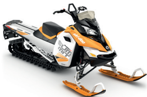
SUMMIT® X 800R 174 shown