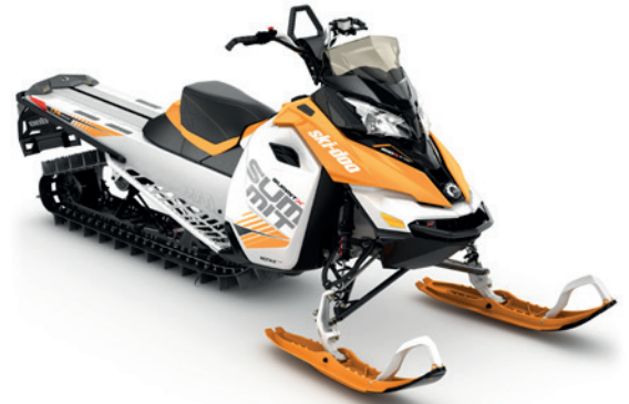
SUMMIT ® X 800R 174 shown