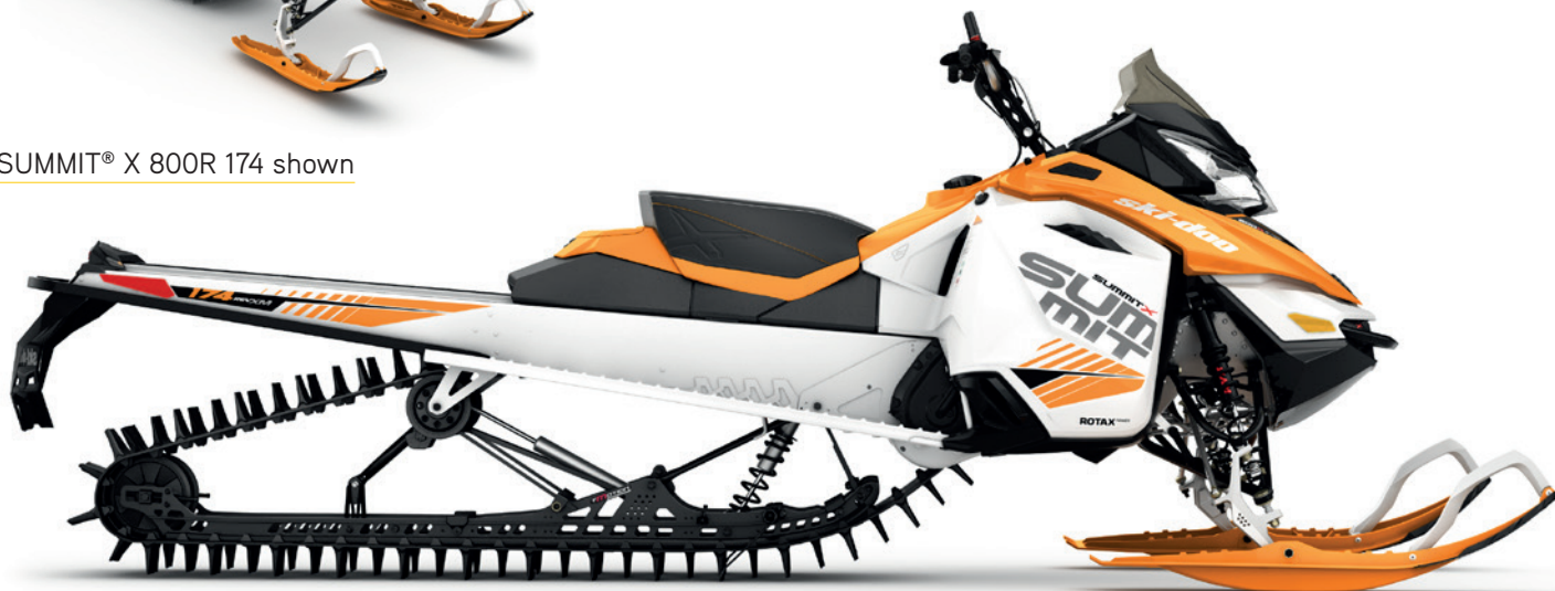
SUMMIT® X 800R 174 shown