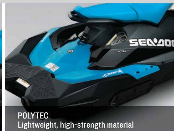
POLYTEC Lightweight, high-strength material