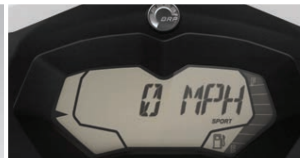
iTC Sport (HO engine) / Touring mode