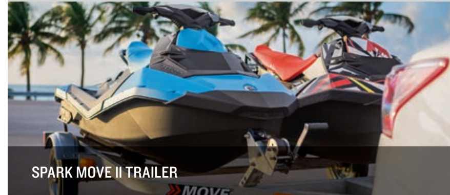
SPARK MOVE II TRAILER