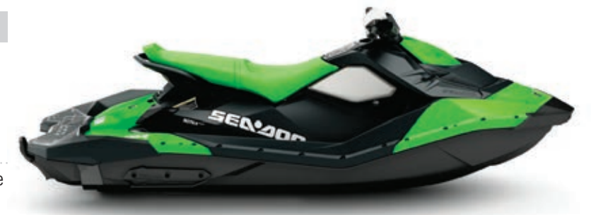
SPARK 3up Key Lime coloration and optional iBR & Convenience Package Plus shown