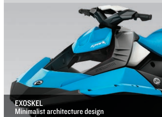
EXOSKEL Minimalist architecture design