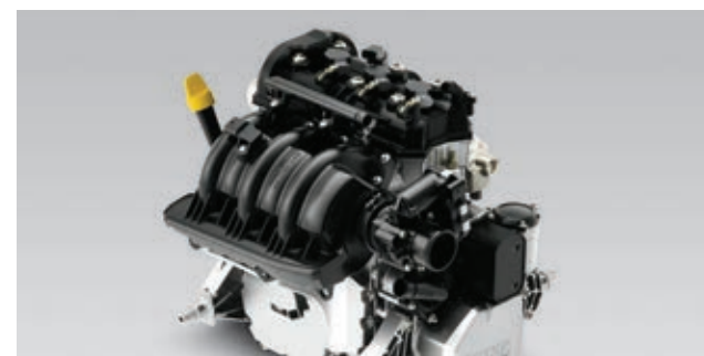
ROTAX 900 ACE / 900 HO ACE ECO friendly