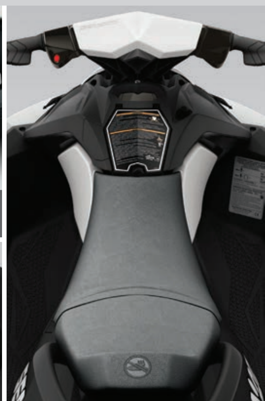
SLIM SEAT Freedom of movement