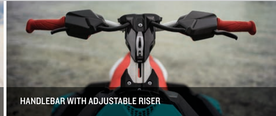
HANDLEBAR WITH ADJUSTABLE RISER