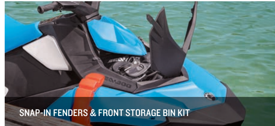
SNAP-IN FENDERS & FRONT STORAGE BIN KIT