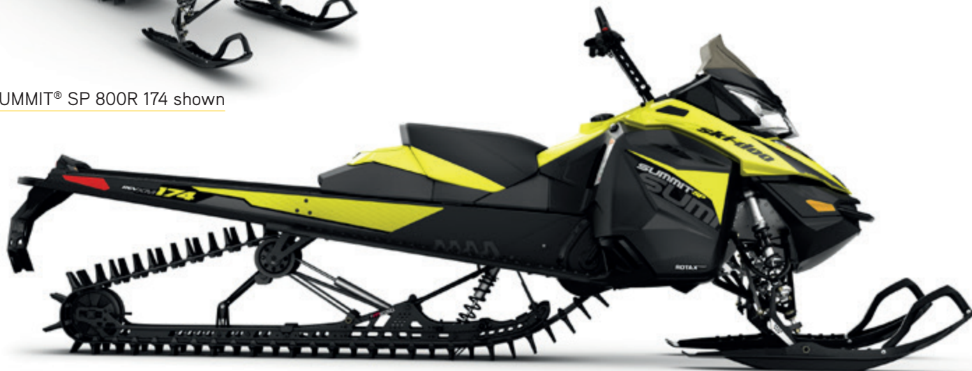
SUMMIT® SP 800R 174 shown