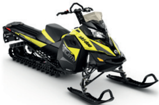
SUMMIT® SP 800R 174 shown