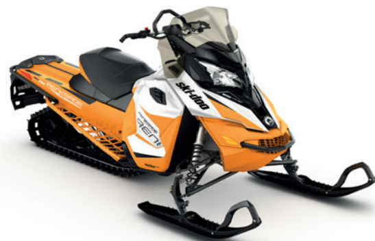
600 H.O. E-TEC shown