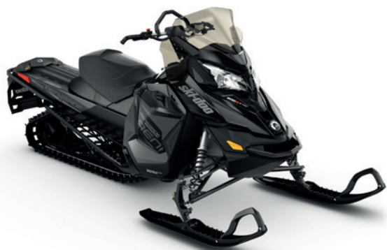
800R E-TEC shown