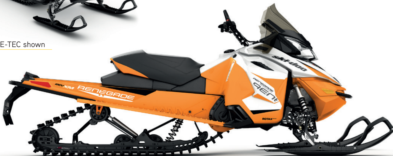
800R E-TEC shown