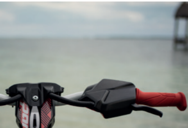
iBR® (INTELLIGENT BRAKE & REVERSE)