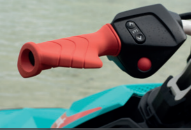
EXTENDED RANGE VTS™ (VARIABLE TRIM SYSTEM)