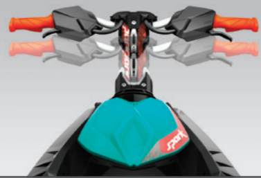
HANDLEBAR WITH ADJUSTABLE RISER

Type SPARK • Short and light platform • Shallow V hull • Playful and easy to maneuver