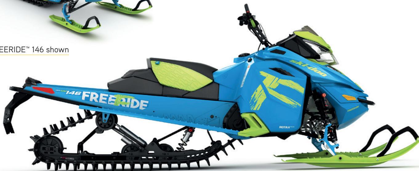
FREERIDE™ 146 shown