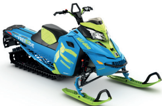
FREERIDE™ 146 shown