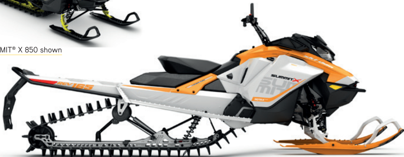
SUMMIT® X 850 shown with Toe-hold accessory