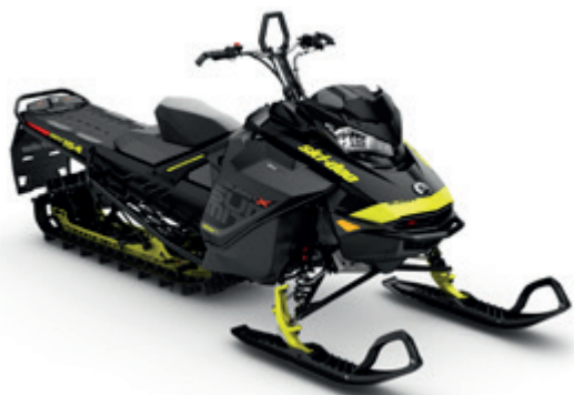
SUMMIT® X 850 shown