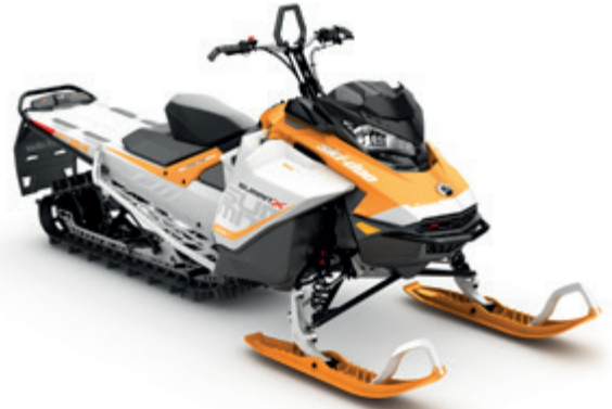
SUMMIT ® X 850 shown