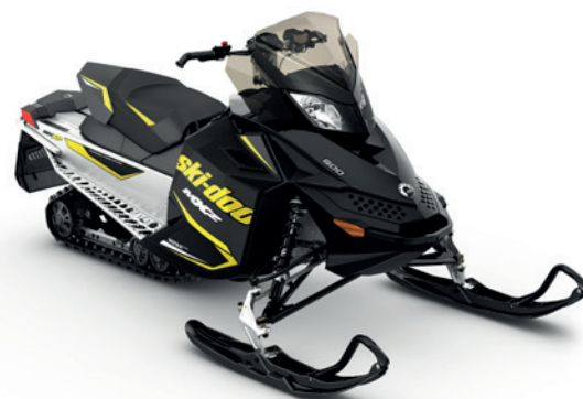
MXZ ® SPORT 600 Carb shown