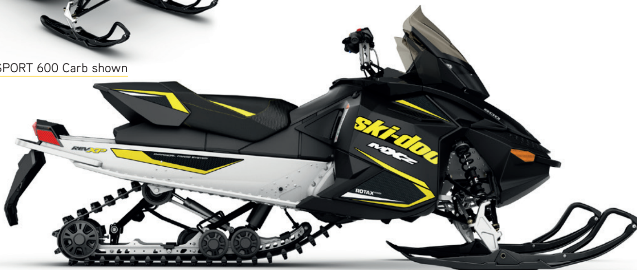
MXZ ® SPORT 600 Carb shown