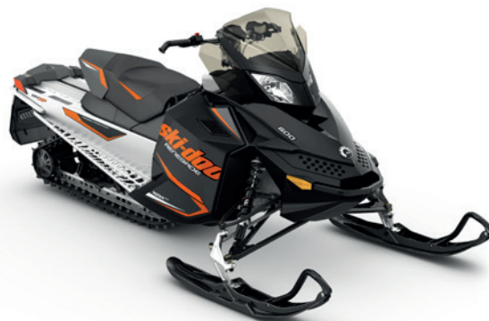
RENEGADE ® SPORT 600 Carb shown