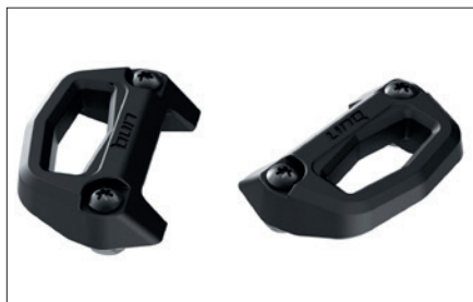
LinQ™ cargo system (option) Our cargo attachment system is the hassle-free way to connect cargo bags or a fuel caddy to your sled in seconds.