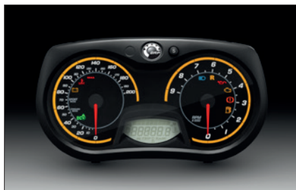
Analog gauge with display