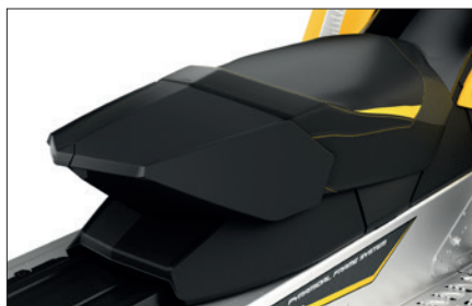
Comfortable REV-XP™ seat Sleek, yet comfortable. Includes trunk with 7 L (1.9 gal).