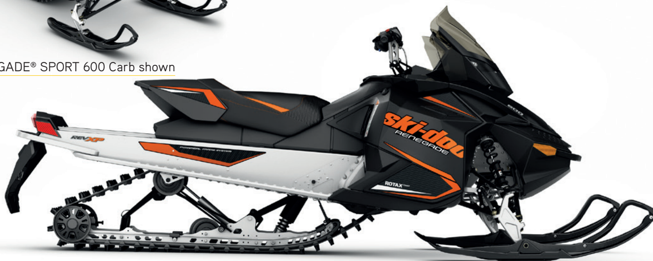
RENEGADE® SPORT 600 Carb shown